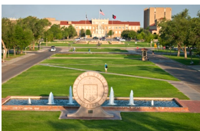
Texas Tech University - Lubbock, TX