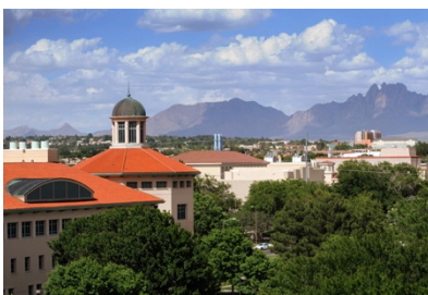
New Mexico State - Las Cruces, NM