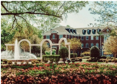
University of Central Arkansas - Conway, AR