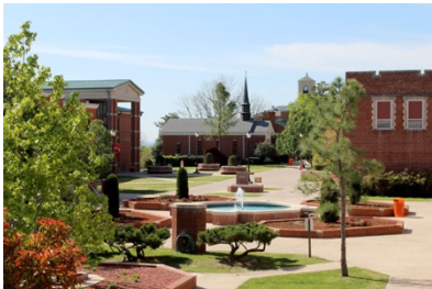
East Central University - Ada, OK

We love the opportunity to work with Christian professors, who find ways throughout the academic year to reflect Jesus to students in word and deed. Here are a few examples from professors we interact with: